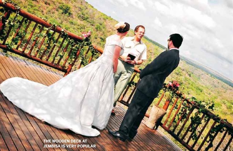
THE WOODEN DECK AT JEMBISA IS VERY POPULAR

to a couple wishing for an intimate moment alone, or to enjoy exclusive use of a game lodge with their closest friends and family to take pleasure in as their own for a few days.”